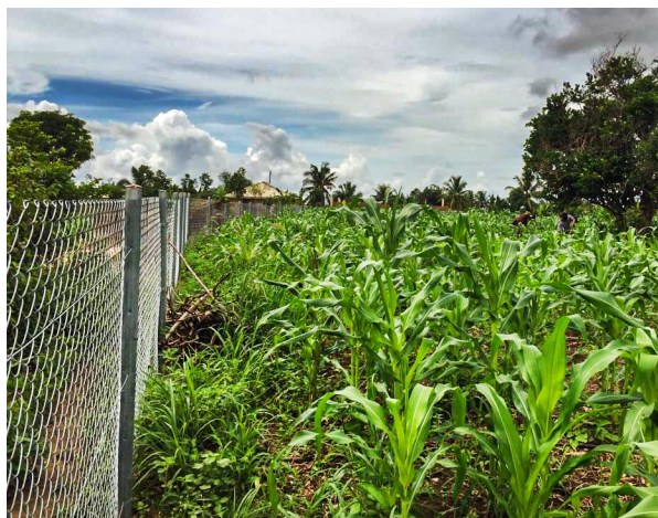
Flourishing Corn Field