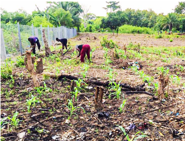
Planting the Corn (Maize)