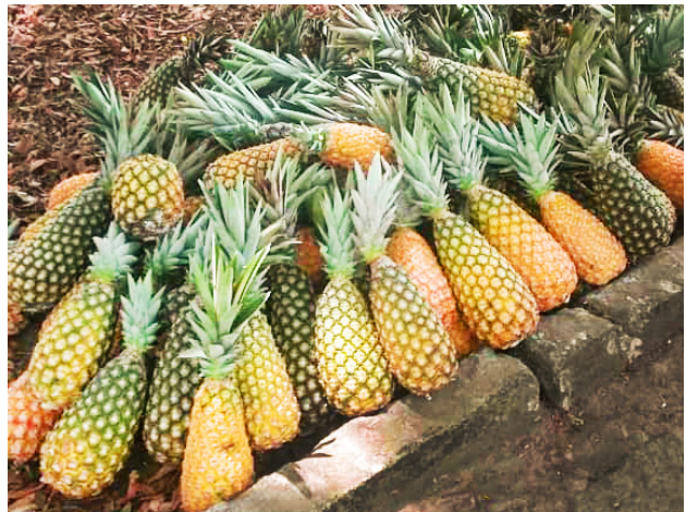
Aphoto Pineapples for the market