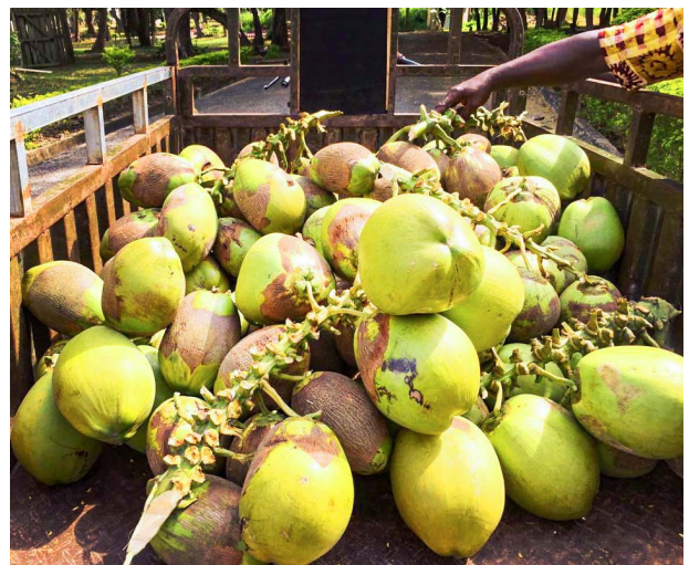
Aphoto Coconuts ready for the market