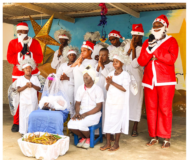
Nativity Play, St. Elizabeth's 2019